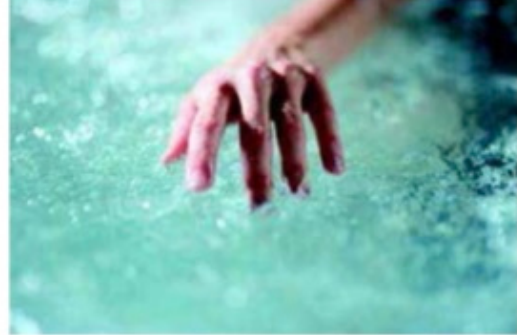
Simply select the filtration configuration that best suits your needs and add your lect one of the suggested economy personal settings.