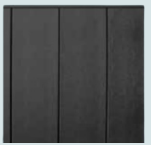
<u>Confer Skirting</u> Black - Standard