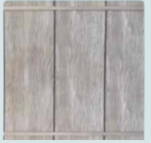
<u>Infinitree Skirting</u> Coastat Gray - Upgrade