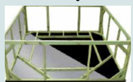
QUALITY PRESSURE-TREATED WOOD STRUCTURE (50-YEAR LIFE EXPECTANCY, MEETS ENVIRONMENTAL STANDARDS). REMOVABLE SIDE PANELS. ANTI-MOISTURE ABS PLASTIC BASE FOR INCREASED STABILITY AND HEAT RETENSION. BASE AND FRAME WITH THERMOFOIL™ PROTECTION. FRAME IS BONDED TO SHELL.

Vinyl Ester resin is also more resistant to solvents and water degradation. It is typically used in Aqua Dream Spas.